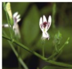
Andrographis Paniculata (Kalmegh)